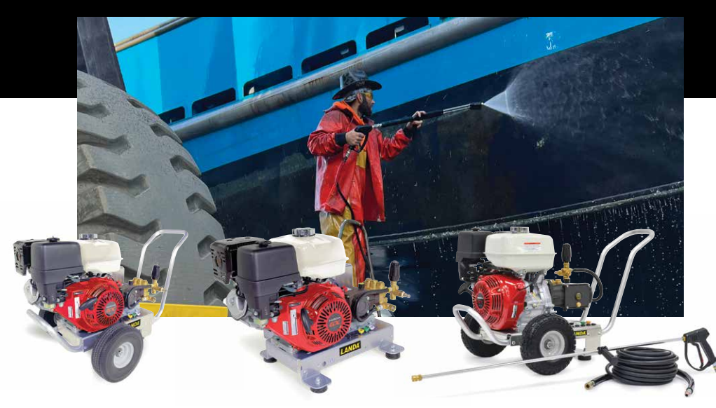
Belt-Drive HD Gas Cart

Compact and corrosion-resistant, the HD Gas aluminum pressure washers can be utilized as a cart or a skid (optional) for maximum cleaning versatility and durability. Easy to maneuver with puncture proof, flat free tires. These reliable Honda powered pressure washers offer a bypass loop for additional pump protection, as well as a 7-year warranty on the oil end of the pump. The simple design of the HD Gas helps get the job done quickly and without hassle. All models are ETL certified to UL safety standards.